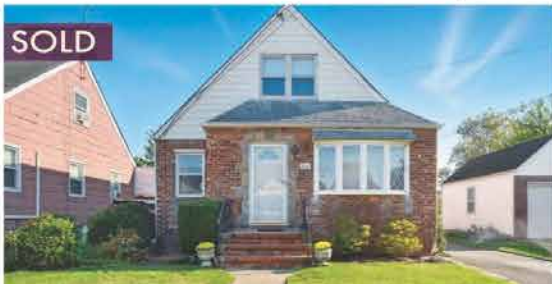
NEW HYDE PARK - 4 BR $779,000