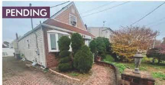
MINEOLA - 4 BR $669,000