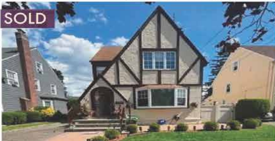
MINEOLA- 456 Macatee Pl. 4 BR $875K