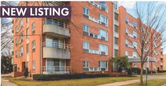
MINEOLA- Corner Condo, 2 BR, 2 Bath $539k