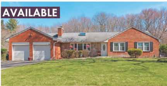
HAUPPAUGE- 1 Acre w/Buildable Lot. $1,200,000

BERKSHIRE HATHAWAY | Laffey International Realty HomeServices 193 Hillside Avenue, Williston Park NY 11596 516-743-9953