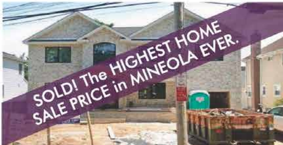
MINEOLA- New Construction Sold for $1,700,000