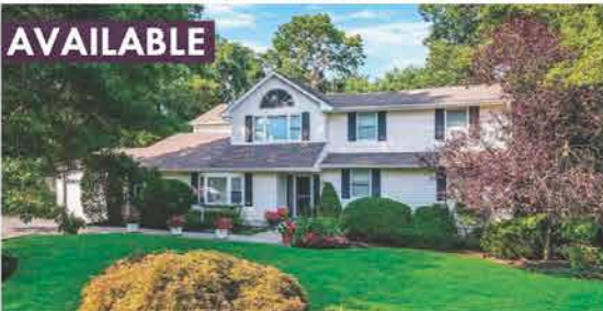
MT. SINAI- Great For Lg. Family, 8 BR $999k