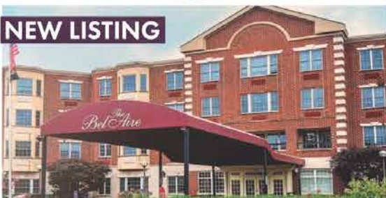
EAST MEADOW- 2 BR, 2 Bath 55+ Condo $475k