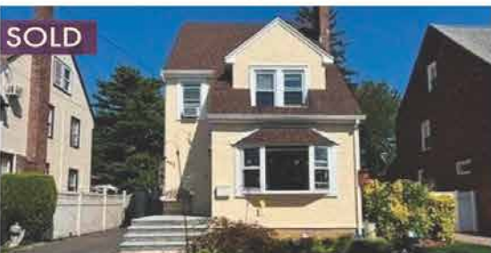
MINEOLA - 452 Macatee Pl. - 4 BR $828K