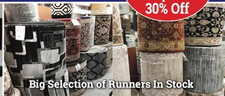
Big Selection of Runners In Stock

SUPER CLEARANCE SAVINGS On In Stock Carpet, Remnants, Area Rugs, Runners & Linoleum