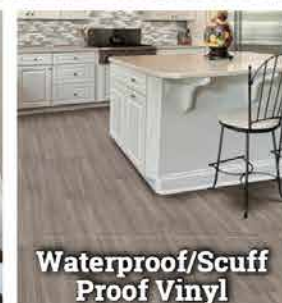
Waterproof/Scuff Proof Vinyl