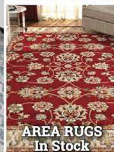
AREA RUGS In Stock