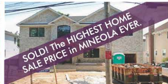
MINEOLA- New Construction Sold for $1,700,000