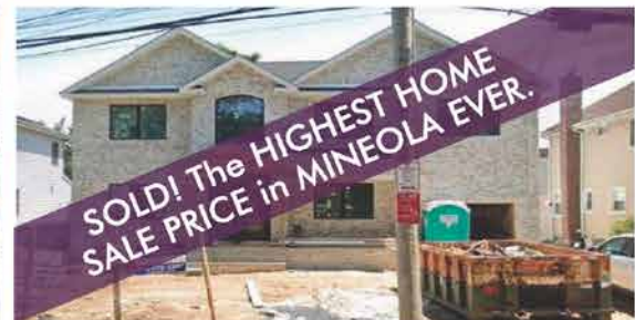
MINEOLA- New Construction Sold for $1,700,000