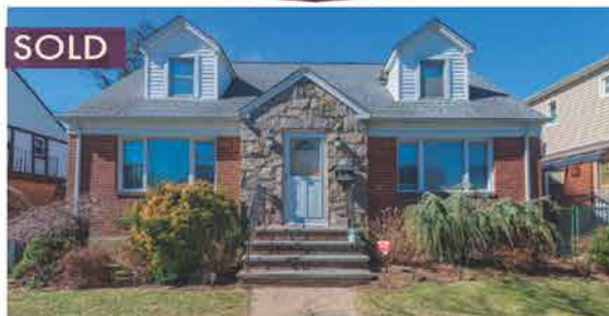
SOLD BELLEROSE - 4 BR Cape $889,000