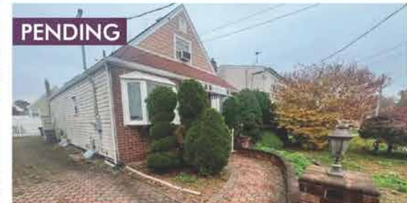
PENDING MINEOLA - 4 BR $669,000

BERKSHIRE HATHAWAY | Laffey HomeServices | International Realty 193 Hillside Avenue, Williston Park NY 11596 516-743-9953