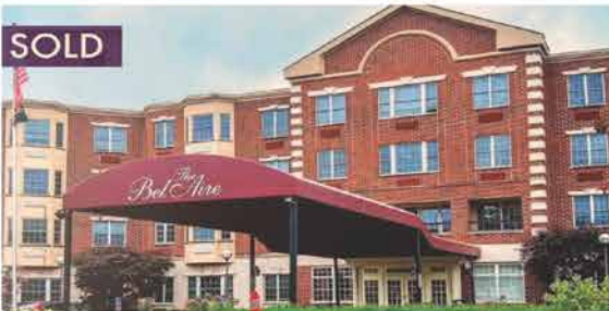
SOLD EAST MEADOW- 2 BR, 2 Bath 55+ Condo $475k