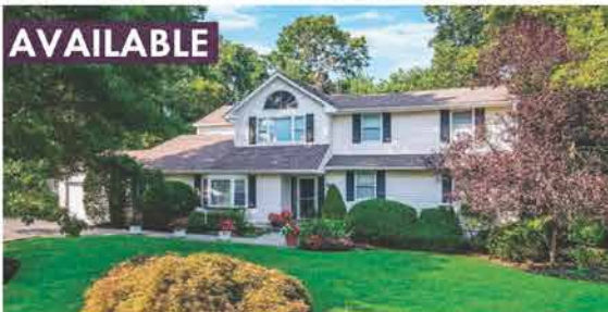
AVAILABLE MT. SINAI- Great For Lg. Family, 8 BR $999k