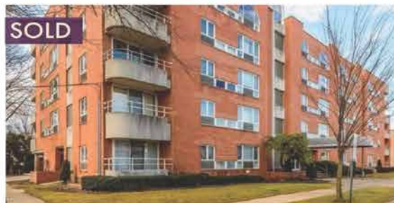
SOLD MINEOLA- Corner Condo, 2 BR, 2 Bath $539k