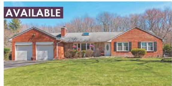
AVAILABLE HAUPPAUGE- 1 Acre w/Buildable Lot. $1,200,000