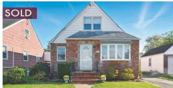
SOLD NEW HYDE PARK - 4 BR $779,000