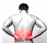
Back & Neck Pain

Personalized care to help you recover, get stronger, and return to the activities you love.