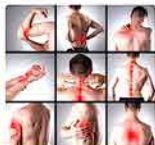
Joint Pain & Arthritis