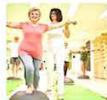
Strength, Mobility & Balance